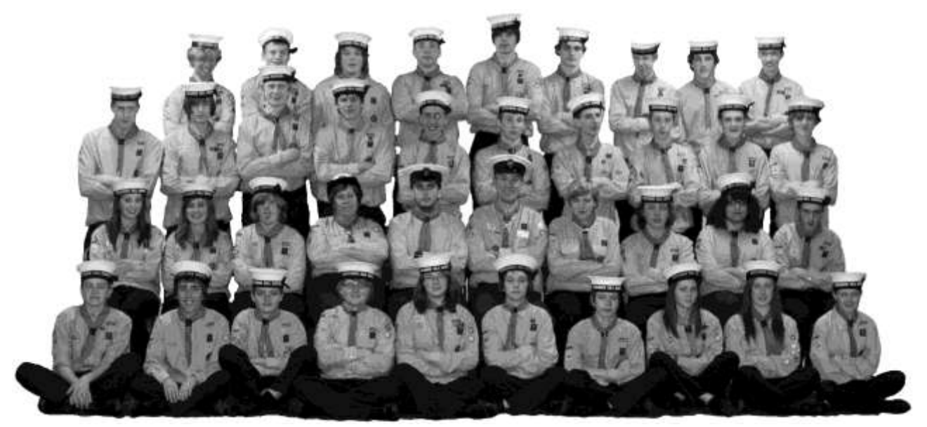
Osprey Explorer Scout Unit - 5th May 2010

Our average attendance was 67%. 20 new members joined us from Scouts. 6 members went on to be Leaders, 1 transferred and 8 left. We have a Unit Forum to make sure our programme is balanced and the Explorer Scouts have a big say in what their programme contains. We include the whole Unit in our forum and set aside a meeting twice a year when everyone can have a say about the Unit and its programme. Our Patrols are reorganised every term to give Explorers the opportunity to mix with different people and hopefully make some new friends. The oldest 6 Explorers become PLs and the next oldest APLs. Anyone with below average attendance in the last term isn't eligible to be a PL or APL. A summary chart of our accounts appeared earlier in this booklet. Thank you to Jacky for her work as our treasurer. At the end of March the Unit held 100 Participation Awards totalling 372 years! Our average participation is over 8 years. 34 of our Explorers have previously been Beavers, Cubs and Scouts. 34 of our Explorers are participating in the Duke of Edinburgh's Award Scheme. 3 Explorers gained both the Bronze D of E Award and the Chief Scout's Platinum Award. 16 of our Explorers are registered with the District Young Leader Unit and help regularly at the Beaver, Cub and Scout sections.