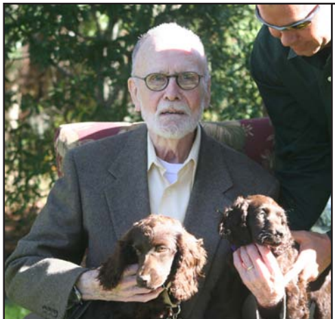
PJF's Pawleys Island "Daisy" and PJF's Pawleys Island "Jackson"

We visit Pawleys Island, SC, Rangeley, ME, and Neshanic Station, NJ at various times of the year. Think of the outdoors available for these two.