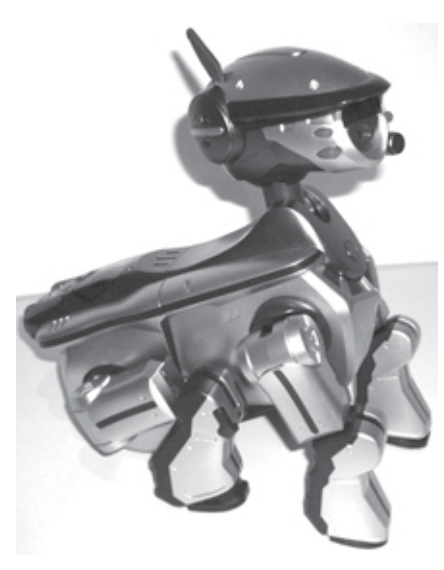
The futuristic ERS-220 AIBO. Available in silver only, the ERS-220 has the most robotic look of all AIBO models. It has a headlight in the middle of its head, an antenna instead of an ear, many colorful lights, and a more tonal sound than the ERS-210 model. There is also an ERS-220A, which, like the ERS-210A, has a faster processor.

Another auction had "ROBOT DOG AIBO like PET" in the title and included in