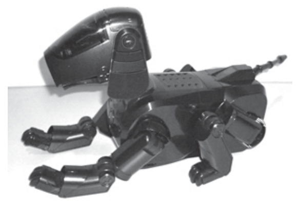
The ERS-111 AIBO. It has a shorter tail, the ears are shaped a little differently, and it was available in two colors: bright silver or metallic black. Software for the ERS-111 required almost double the time for the AIBO to develop from "newborn" to "adult" from software released with the ERS-110. Like the ERS-110, it responds to tonal sounds from a "Sound Controller" remote control.

Of course buying any used AIBO is subject to risks just as there are risks when buying any high tech equipment. Is the owner selling because they are downsizing their collection? Are they selling because of problems with the AIBO they haven't been able to resolve? When buying a pre-owned AIBO, it's not unreasonable to ask the owner questions such as why are they selling the AIBO and have they had any problems, fixed or otherwise.