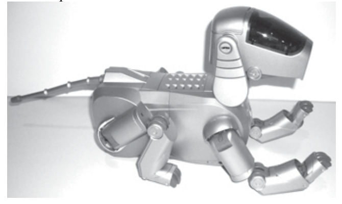
The ERS-110, Sony's original AIBO released in 1999. The ERS-110 only came in a soft silver color.

Historically, overstock and manufacturer refurbished AIBOs have shown up on sites such as unbeatable.co.uk, ecost.com, or ubid.com. Occasionally a pre-owned AIBO may show up on Amazon.com. AIBO enthusiasts are usually the first to snap up AIBOs sold