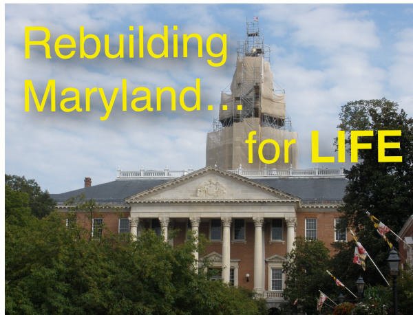
The Maryland State House under construction.

Director of the Powell Center for Medical Ethics, National Right to Life “I Came, I Saw, I Was Denied Treatment”