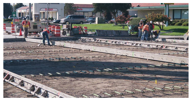
Figure 3. Setting forms and installation of dowel bar baskets

Construction of PCCP intersections requires some type of fixed-form construction to accommodate short paving segments, varying paving widths, and curved paving areas. The forms were placed to allow placement of the PCCP with roller screeds. Figure 3 shows the erection of forms. Dowel bar baskets were pre-fabricated with ten epoxy coated dowel bars per joint and were placed between the forms.