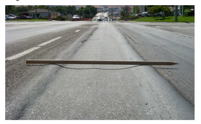
Figure 1. Severity of pavement rutting at an intersection

temperatures during the summer months. They had severe ruts, as much as 2 to 4 inches or more. Despite routine maintenance, minor ruts reappeared after a few months with severe ruts within a year after rehabilitation. Figure 1 depicts the level of severity of pavement rutting at an intersection. The purpose of this reconstruction with PCCP was to provide a quality long-life pavement with minimal user disruption which will result in safety improvements and a significant reduction in user costs.