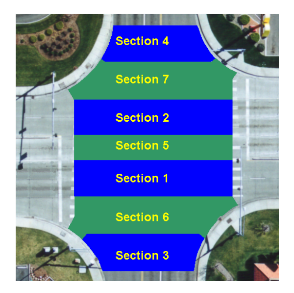
Figure 4. Concrete placement in interim Sections

As soon as practicable after concrete placement, temperature sensors were embedded into the fresh concrete. Sensors were connected to maturity instruments and the recording device was activated. Using the strengthmaturity relationship developed in the laboratory, the value of compressive strength corresponding to the measured maturity index could be read from the instrument. Maturity meters were used to determine form removal and time of opening to traffic.