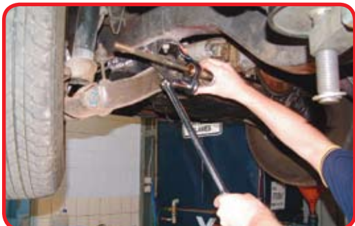
Cam design increases force as load is applied

Prevents damage to rack components. Use for removal or installation