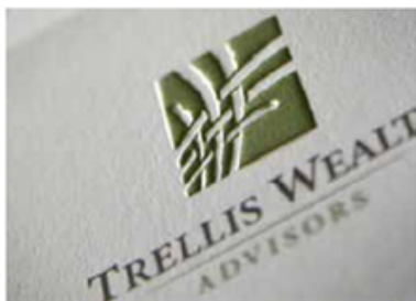
1 to 4 color offset printing