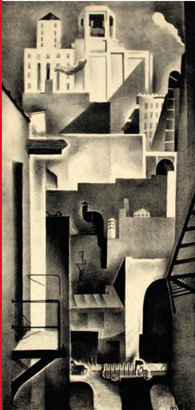
Benton Spruance, Shells of the Living , 1933, lithograph

Skyscrapers to Subways in New York City 1913–1949