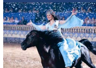
Arabian Nights Dinner Show