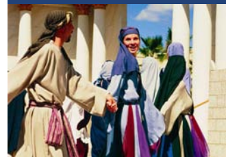
The Holy Land Experience